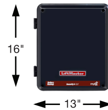
LA500CONTDC Standard Control Box