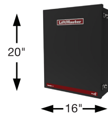
LA500CONTXLMDC XLSOLARCONTDC Extra Large Control Box

* Basic set up with remotes programmed. Does not include added accessory power draw. LiftMaster low power draw accessories recommended to extend cycles and standby time on battery backup.