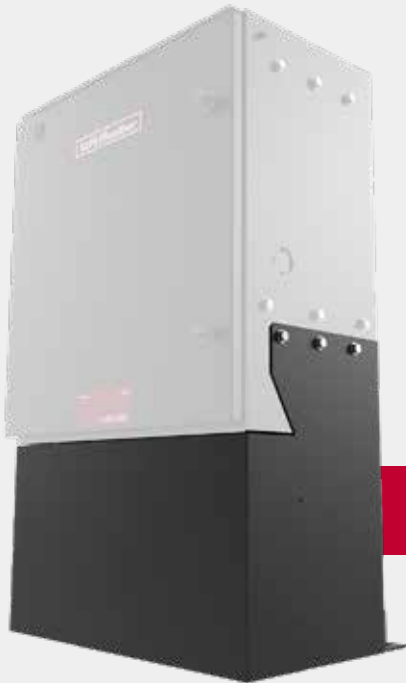
MRIN Riser Mount

Intentionally built to make upgrading a cost effective solution. They're reliable, durable and get the job done. Now with even more added versatility when attached to the MRIN Riser Mount.